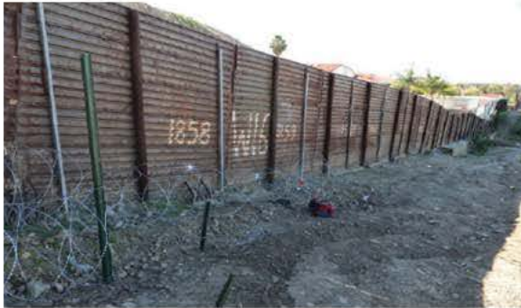
Figure 1: Border Fencing and Concertina Wire