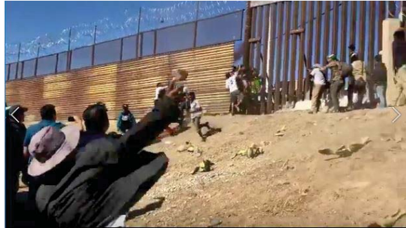
Figure 4: Rock Being Thrown at Border Patrol Agents

In incident statements, Border Patrol agents generally indicated that migrants began making verbal threats and throwing rocks at them, while damaging fencing and the dirt berm in the Tijuana River channel. Six Border Patrol agents reported individuals in Mexico were throwing rocks at CBP personnel while hiding behind members of the media. Figure 4 is a photo of a rock being thrown from Mexico toward Border Patrol agents on November 25, 2018. One CBP officer and 39 Border Patrol agents responded multiple times with various less-lethal devices, such as those shown in appendix C, reportedly to protect either themselves or other CBP officers and Border Patrol agents. See figure 5 for a map of the November 25, 2018 incident and the approximate locations where the CBP officer and Border Patrol agents responded with less-lethal devices.