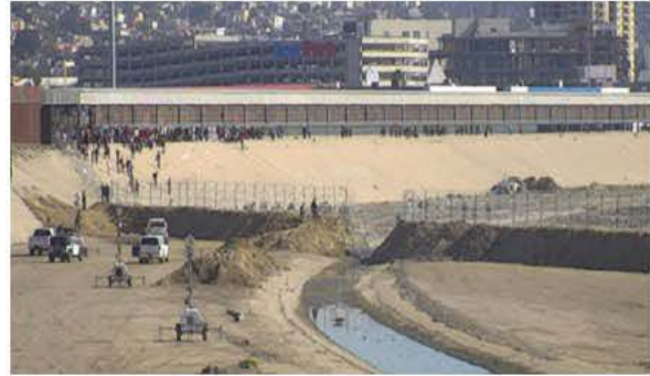
Figure 2: Tijuana River Channel with Concertina Wire and Dirt Berm

On November 25, 2018, about 1,000 migrants attempted illegal entry into the United States near the San Ysidro, California Port of Entry (POE) in the San Diego Sector. On January 1, 2019, a group of about 100 migrants attempted to enter the United States illegally west of the San Ysidro, California POE. CBP personnel who used less-lethal devices in connection with both incidents generally reported they did so to protect themselves or other officers and agents from migrants throwing rocks and other projectiles. Less-lethal force included using some of the devices identified in appendix C. In both incidents, the wind carried the tear gas into Mexico and some of the munitions crossed the border and landed in Mexico. Additionally on November 25, 2018, according to CBP, it intended to employ an acoustic device to broadcast spoken announcements to deter migrants from illegally crossing into the United States. However, the device was used in an “alert tone,” reportedly to deter migrants from throwing rocks and projectiles. 5 See figure 3 for an image of the acoustic device. CBP’s actions temporarily stopped the rock and projectile throwing, as well as attempts to cross the border, and ended when Mexican law enforcement arrived. During the November 25 incident, six agents reported being hit with rocks and other projectiles.