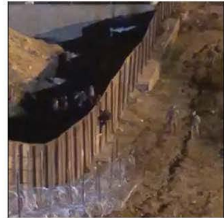
Figure 6: Migrant Being Lowered over Border Fence

On January 1, 2019, two similar incidents occurred at the same location, at two separate times between approximately 1:45 am and 2:45 am. In the first incident, CBP estimated 100 migrants were congregating in a large open space overlooking the international boundary fence approximately 5 miles west of the San Ysidro, California POE. The second incident involved approximately 45 migrants congregating in the same location. In incident statements, Border Patrol agents said individuals, including young children, were being lowered over the international boundary fence into the United States near concertina wire. According to CBP, Border Patrol agents instructed the migrants to move away from the fence, but instead they moved toward it and began illegally crossing into the United States. Figure 6 shows a person being lowered over the border fence on January 1, 2019. In both incidents, Border Patrol agents reportedly deployed smoke devices 8