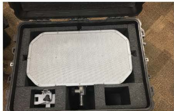
Figure 3: Image of the Acoustic Device

On November 25, 2018, about 1,000 migrants attempted illegal entry into the United States near the San Ysidro, California Port of Entry (POE) in the San Diego Sector. On January 1, 2019, a group of about 100 migrants attempted to enter the United States illegally west of the San Ysidro, California POE. CBP personnel who used less-lethal devices in connection with both incidents generally reported they did so to protect themselves or other officers and agents from migrants throwing rocks and other projectiles. Less-lethal force included using some of the devices identified in appendix C. In both incidents, the wind carried the tear gas into Mexico and some of the munitions crossed the border and landed in Mexico. Additionally on November 25, 2018, according to CBP, it intended to employ an acoustic device to broadcast spoken announcements to deter migrants from illegally crossing into the United States. However, the device was used in an “alert tone,” reportedly to deter migrants from throwing rocks and projectiles. 5 See figure 3 for an image of the acoustic device. CBP’s actions temporarily stopped the rock and projectile throwing, as well as attempts to cross the border, and ended when Mexican law enforcement arrived. During the November 25 incident, six agents reported being hit with rocks and other projectiles.