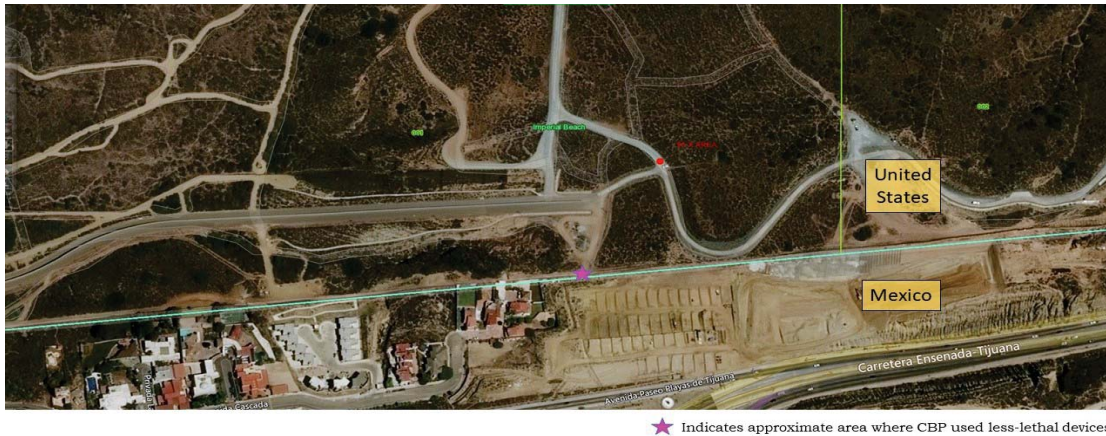
Figure 7: Map of the January 1, 2019 Incident