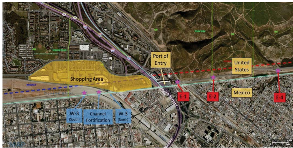
Figure 5: Map of November 25, 2018 Incident