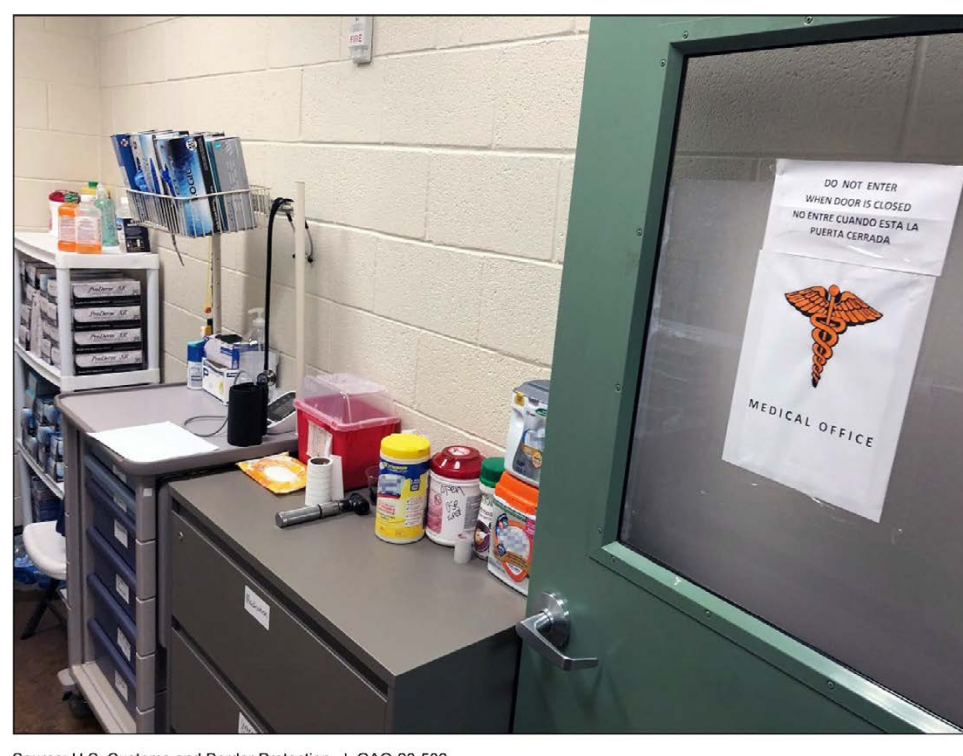
Figure 2: Contracted Medical Provider Office at a U.S. Border Patrol Station

GAO-20-536