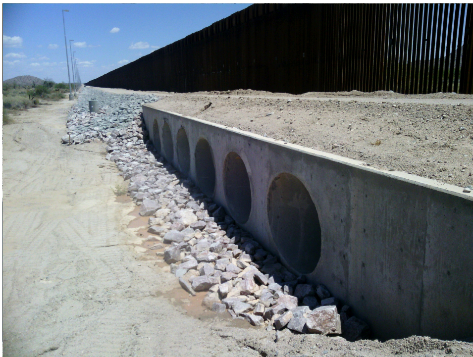
Protect culverts with appropriate drainage measures