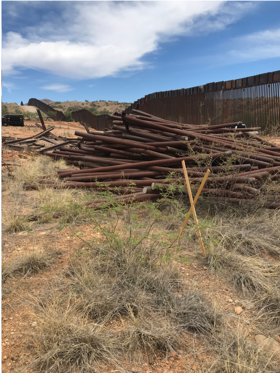
Reseed staging areas outside of the Roosevelt Reservation