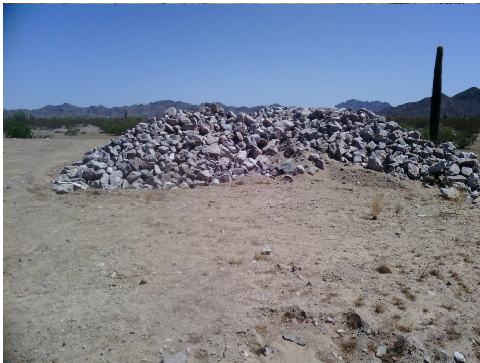
Remove construction materials and reseed staging areas outside of the Roosevelt Reservation