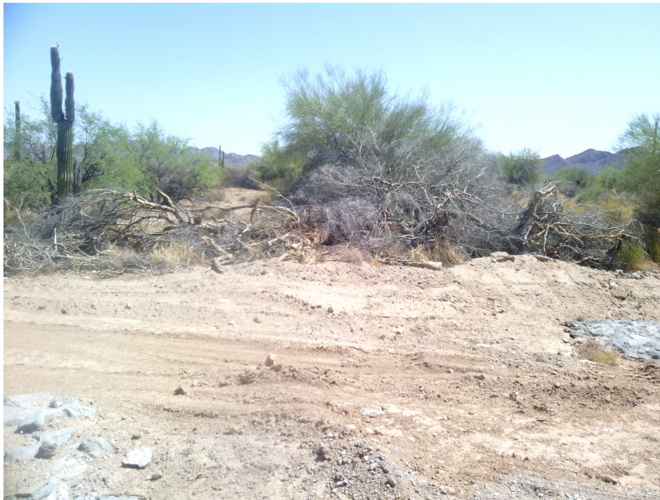
Remove vegetation debris north of the Roosevelt Reservation and reseed disturbed land