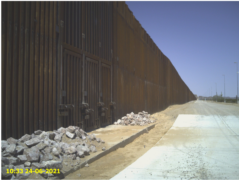
Protect low water crossings with appropriate drainage measures