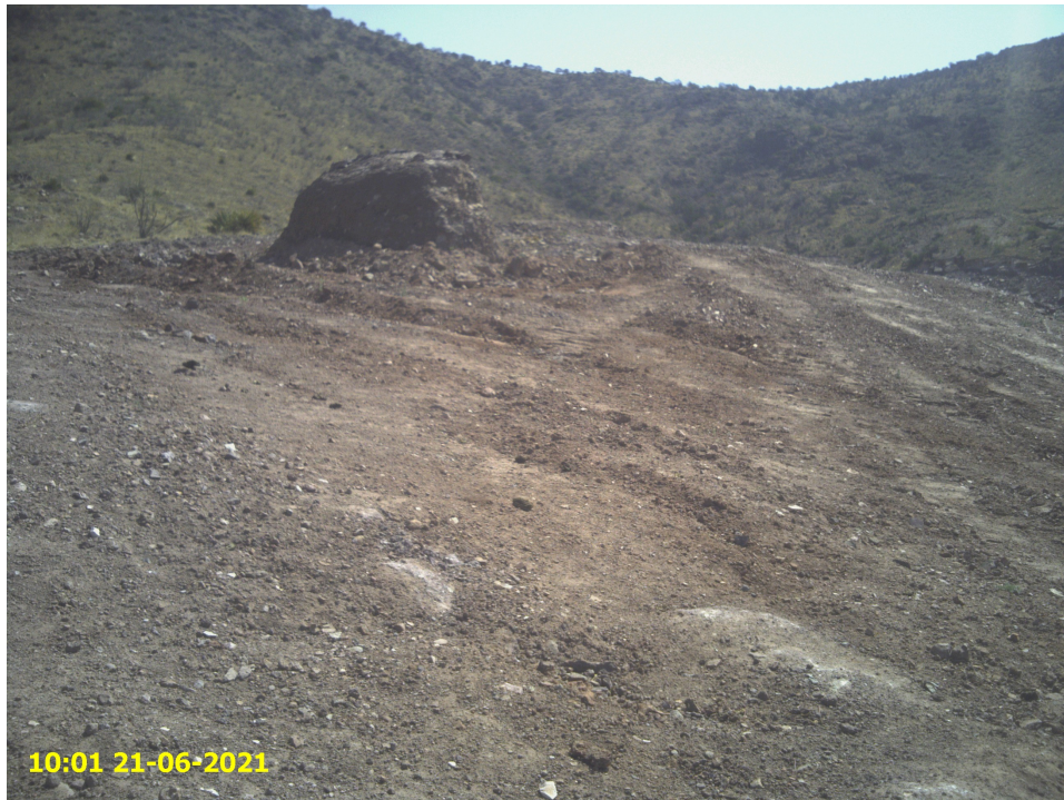
Reseed staging areas outside of the Roosevelt Reservation