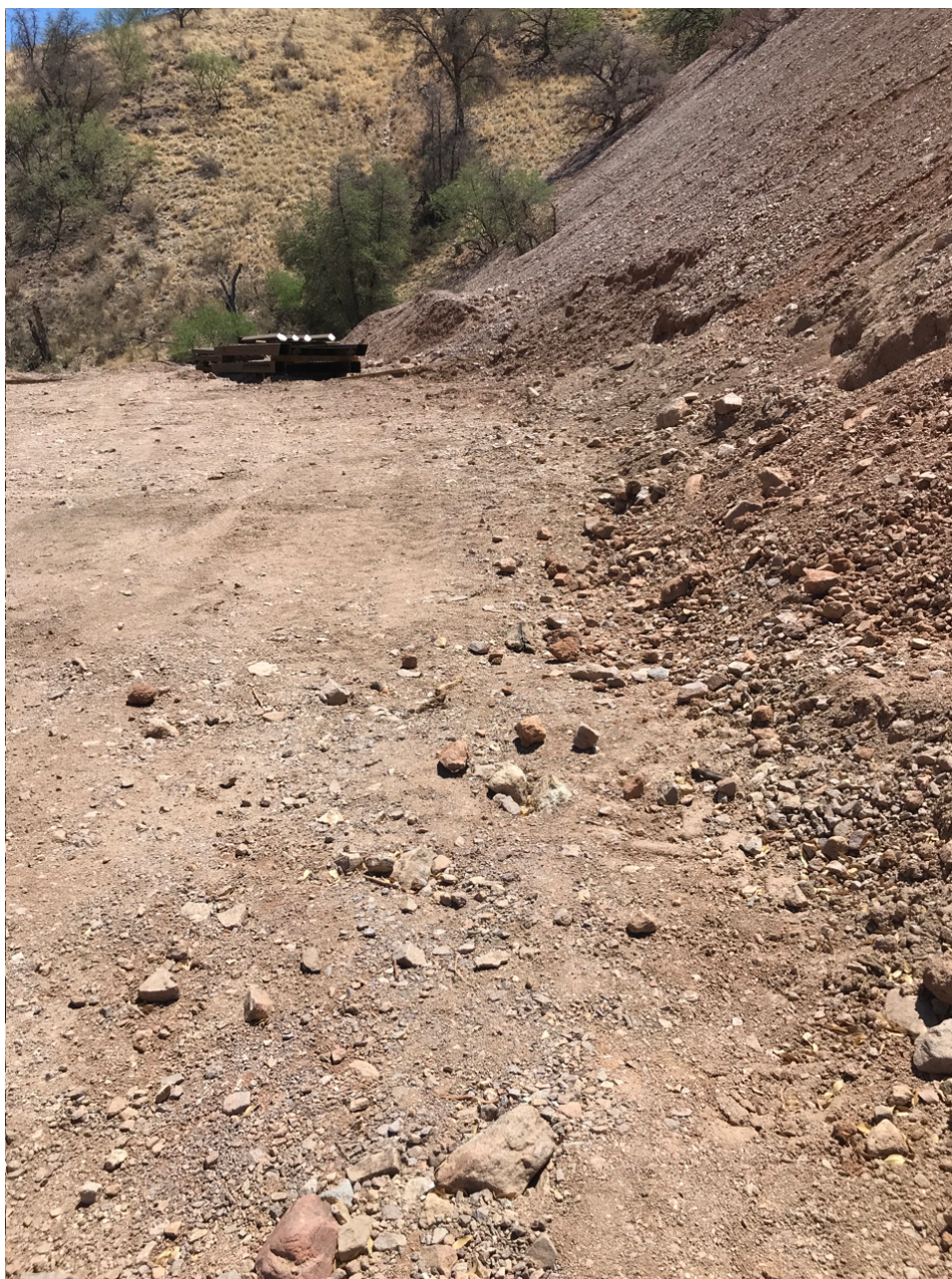
Installation of embankment/slope stabilization along slopes and drainages