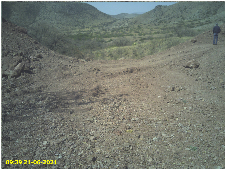
Protect low water crossings with appropriate drainage measures