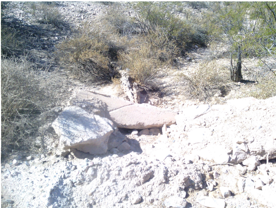
Protect culverts with appropriate drainage measures