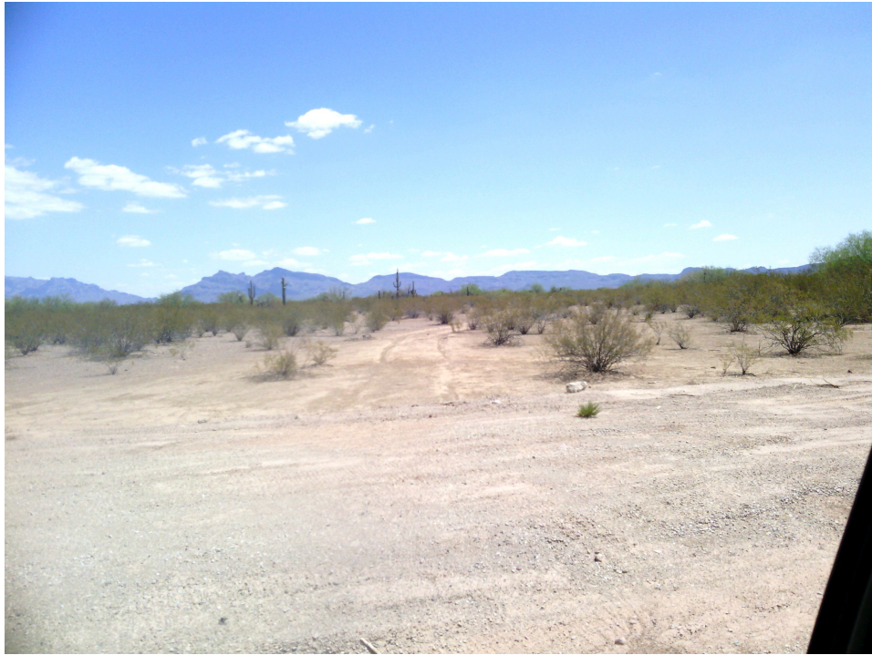
Restore, retain, or decommission roads used in construction