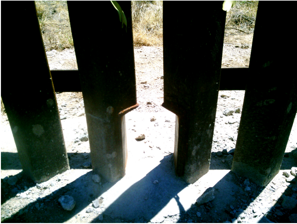
Install and maintain small wildlife openings