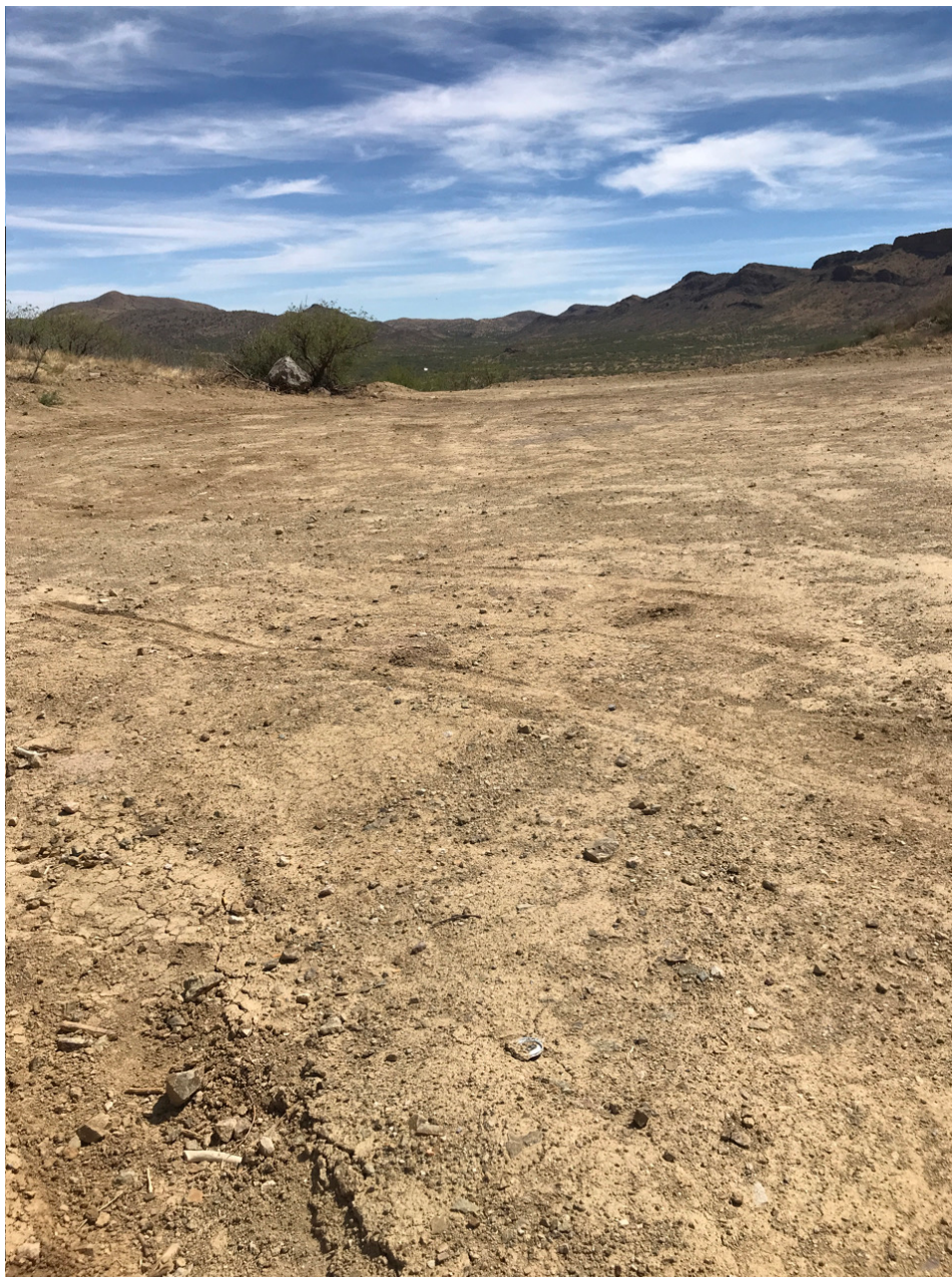
Reseed staging areas outside of the Roosevelt Reservation